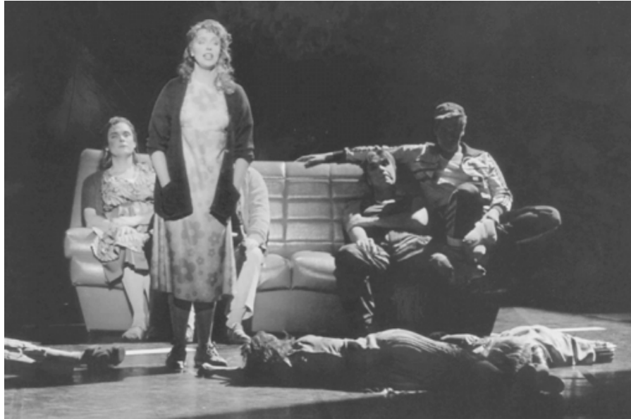
Example 4.3: Anne Sofie von Otter as Anna I, with the family (from left to right,) Nicholas Cavallier (bass) as Anna’s mother, Ian Caley (tenor, behind Anna I) as Anna’s father), and Stefan Margita (baritone) and Nigel Smith (tenor) as Anna’s two brothers

The religious references in The Seven Deadly Sins —including the seven deadly sins for which the sections are named—are satirical; neither Weill (a nonpracticing Jew) 126 nor Brecht (a secular intellectual) had much use for organized religion. It is when Anna acts on basically decent impulses that she is chastised by her family for her “sins.” Anna II, the dancer, represents the humane and loving aspects of Anna; Anna I is “practical” by her own account, while Anna II is “the one with the looks.” This plays out