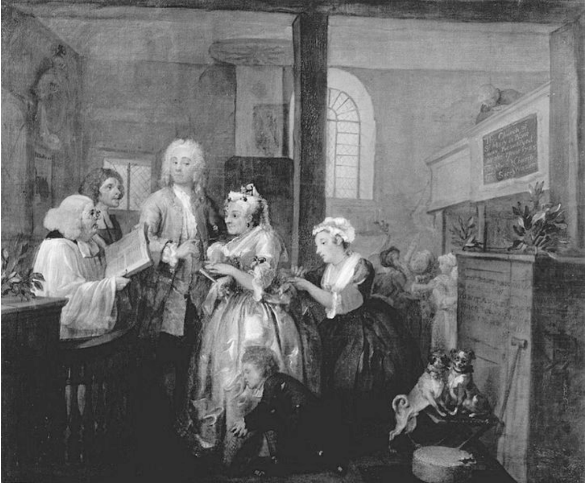
Example 5.1: A Rake's Progress V: The Marriage (1795) by William Hogarth, oil on canvas

While there is little evidence in the libretto to suggest that Tom is homosexual, I suggest that it is not entirely outside the realm of possibility. Tom is eager to leave Anne for London, and he quickly departs. In his duet with Anne, Tom indicates that he is anxious to be gone from their idyllic life together: