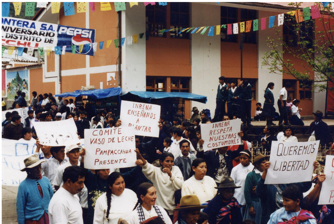
2. Campesinos from the district Community of Pampacahua, marching in the civil-parade of the 40 th anniversary festival of the District of Machu Picchu – their banners protesting INRENA control.