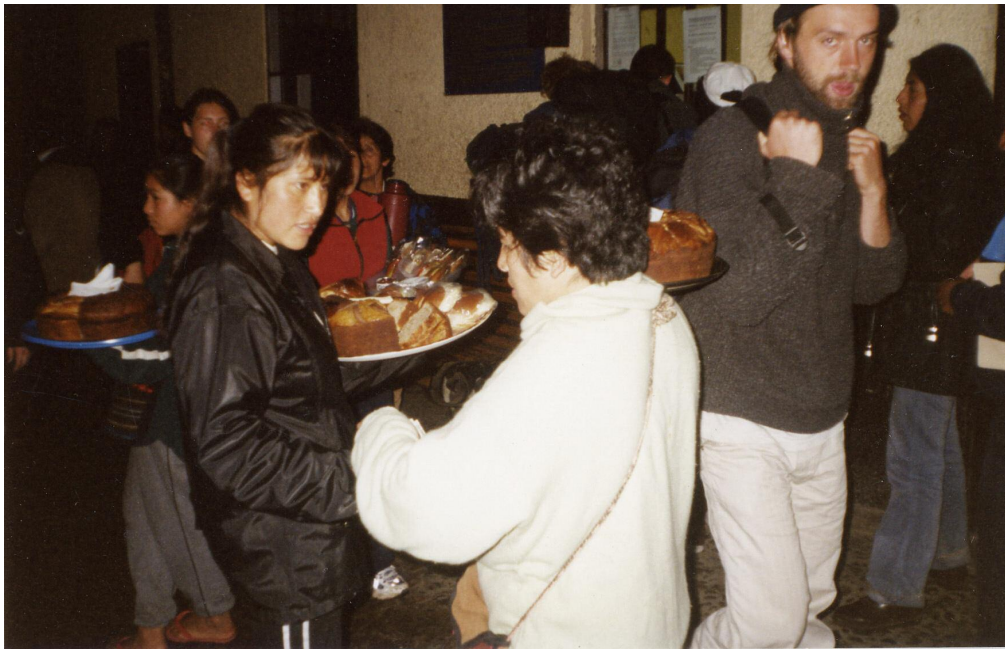
8. Local street sellers (ambulantes) selling food and snacks to tourists purchasing tickets for the early morning train to the City of Cuzco.