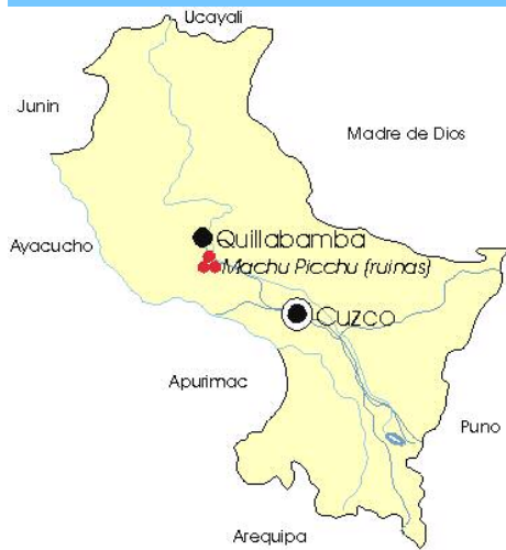
Above: Map of Peru (Location of Machu Picchu highlighted) Below: Basic Map of Cuzco Region (Machu Picchu shown relative to the City of Cuzco)