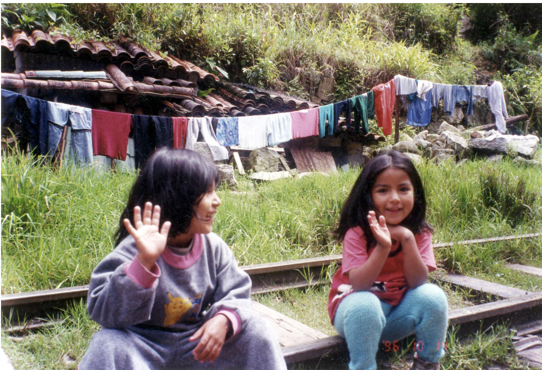
11. Two young Machupiccheñas resting on the train tracks that runs by their homes.