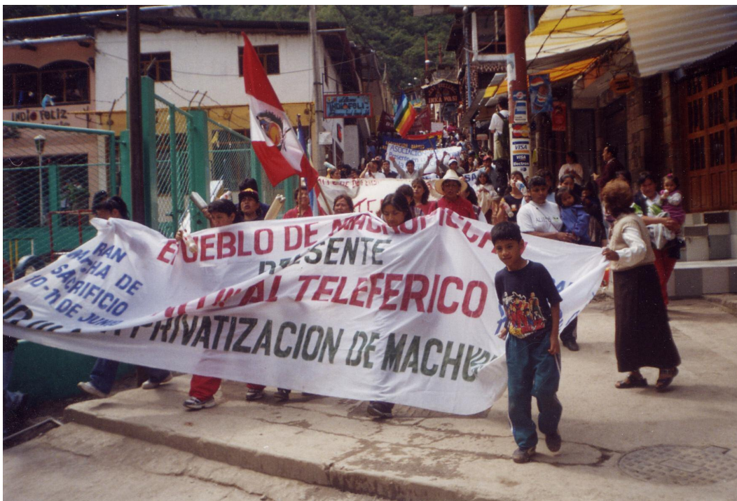
6. Protest march during the pueblo stoppage. The front banner denounces privatization and plans to build a cable-car.