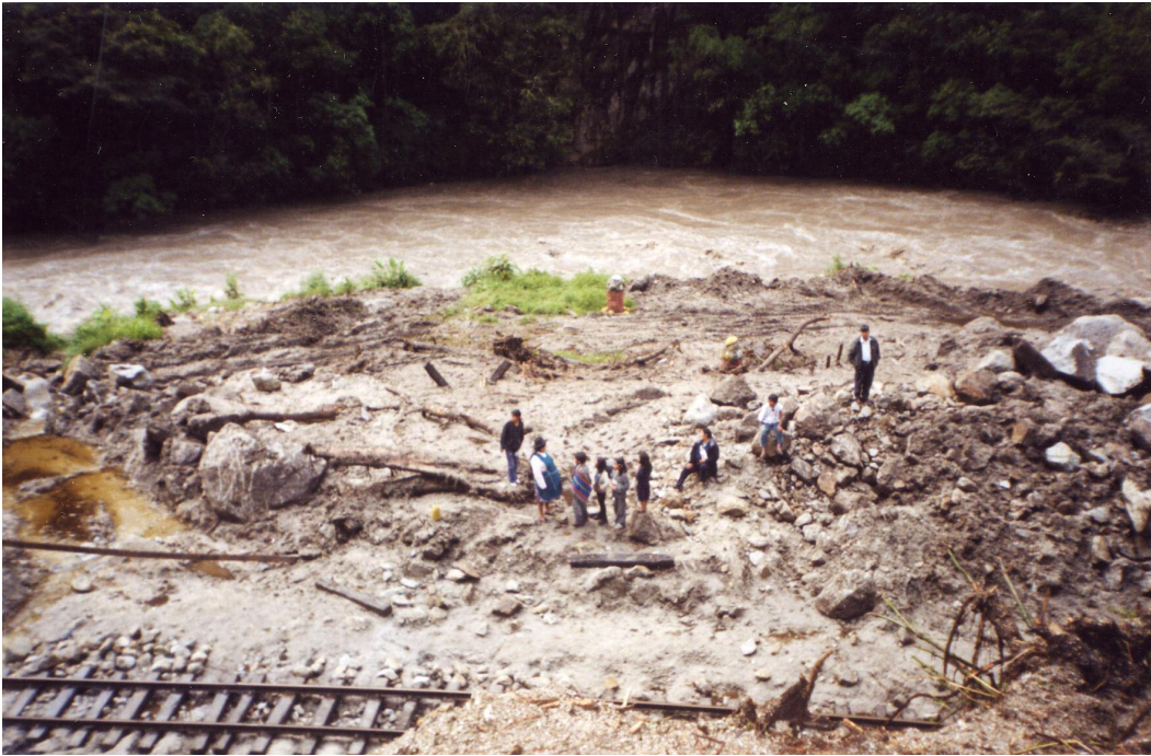
10. Residents examining the destructive aftermath of a night time landslide on the outskirts of the pueblo.