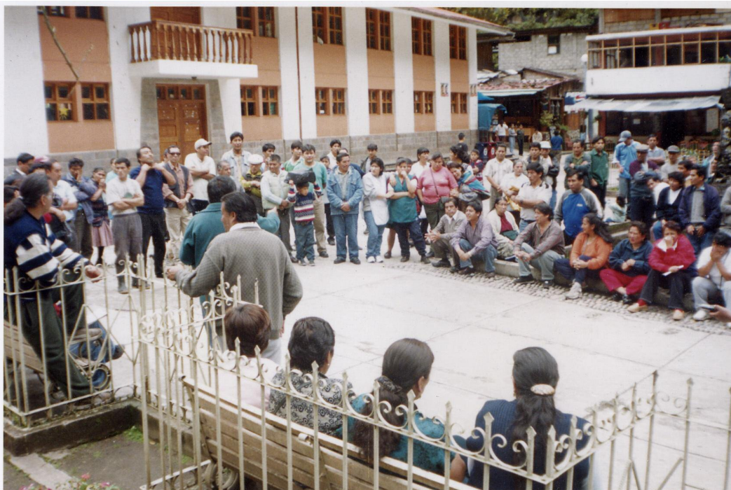
5. One of the many pueblo meetings held in the plaza. Here people are deciding how much time to give authorities to respond to their petition before holding a stoppage.