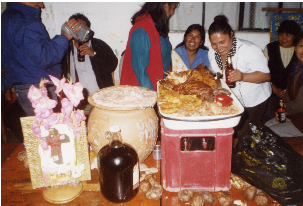
9. A resident fulfilling her cargo duties with offerings of chicha, beer and local foods during the Festival of the Cross.