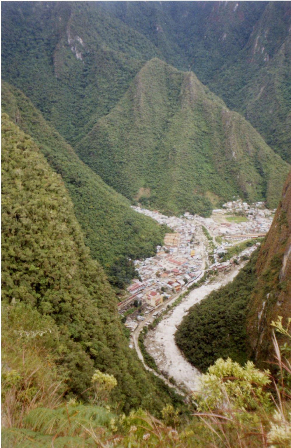
1. The Pueblo of Machu Picchu viewed from the Mountain of Putucusi.